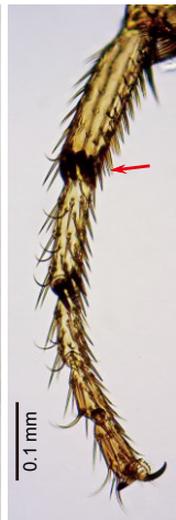
Male fore tarsus