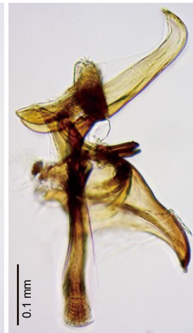
Phallic organs (lateral view)