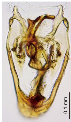
Phallic organs (ventral and ventrolateral views)