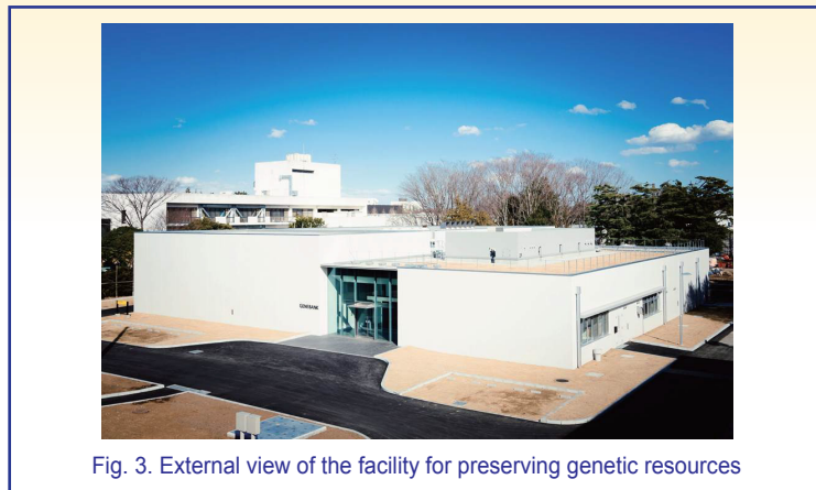
Fig. 3. External view of the facility for preserving genetic resources

The NIAS Genebank can be accessed at the following website: http://www.gene.affrc.go.jp/index_en.php