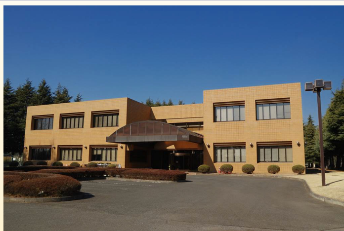
Fig. 1. External view of the facility for managing the genetic resources of organisms relating to agriculture, forestry, and fisheries.

Through bilateral joint research with agricultural research institutions in developing countries, the NIAS Genebank has applied itself to perform exploration, characterization, and the ex-situ conservation of traditional crops that are being lost. The NIAS Genebank has also provided these genetic resources and their information to domestic and foreign researchers in order to allow them to use these genetic resources and crop varieties for research and educational purposes. At present, the NIAS Genebank preserves approximately 220,000 plant genetic resources and distributes approximately 8,000 plant genetic resources each year.