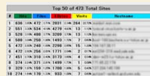
◆ Search ranking sorted by IP address