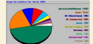
◆ Analysis graph sorted by country

The pictures above show examples of outputs from the Webalizer. All kinds of information such as the number and details of webpage access sorted by month, most frequently accessed page, user information, users sorted by countries, etc can be obtained. By referring to the result of these analyses continuously, we can take the appropriate action to provide users with valuable information.