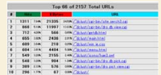
◆ Search ranking sorted by URL